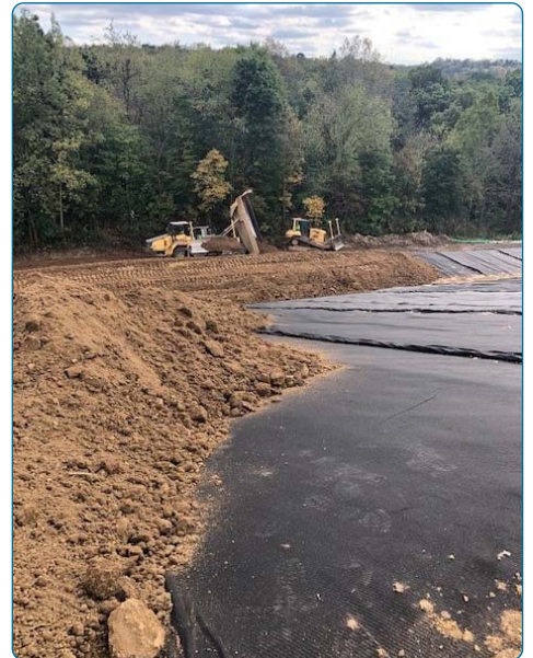
Two feet of clean soil is placed over top of a geomembrane cap liner during closure of landfill areas.

Capping of Landfill 6 is expected to continue for about four more years.