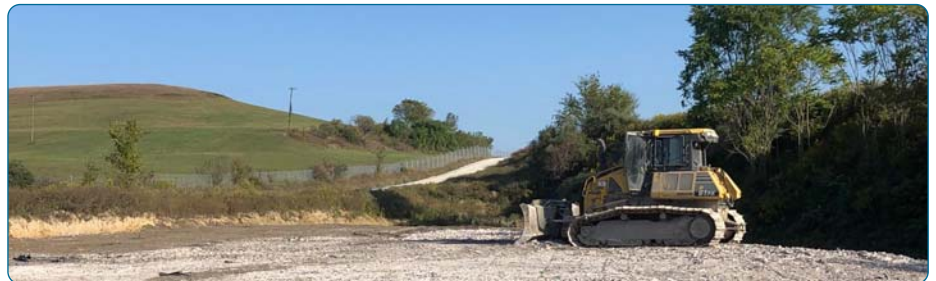
Work to reclose former Impoundment 1A will begin later this year. Shown here is a view of the work area with the site entrance road in the background.

As soon as weather permits, work to cap and reclose the last section of former Impoundment 1 on MAX's property will begin. The closure work is expected to be completed around summer, at which point crews will begin reclosing Impoundment 1A. (See map on page 2.)