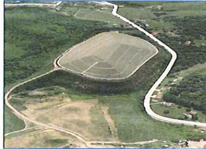
View from the west