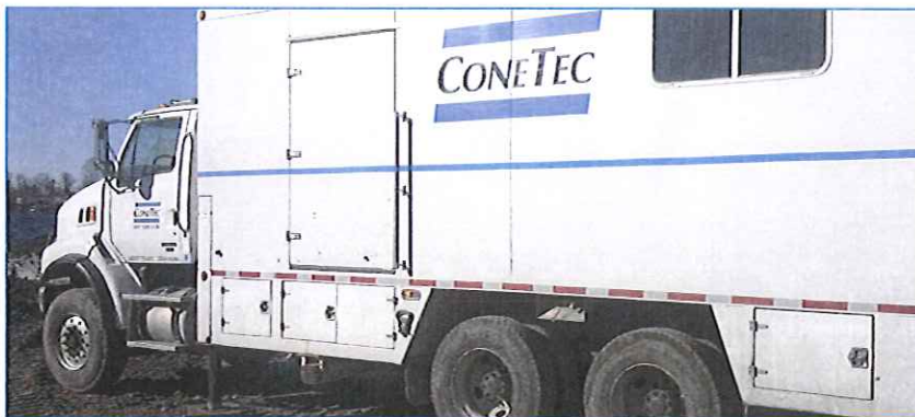
In December 2013, contractors performed additional stability tests on the buried material in Impoundment 6 to ensure it was of adequate density and material strength to support expansion.