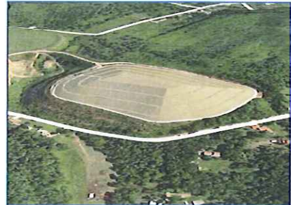
View from the south

The proposed height increase would occur in steps, beginning inside the landfill embankment and rising gradually to a maximum increased height of 40 feet in the center. The final surface of the impoundment will be capped and vegetated in phases.