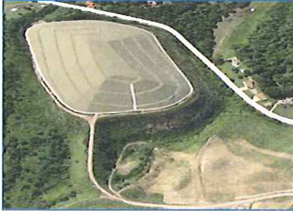
View from the northwest